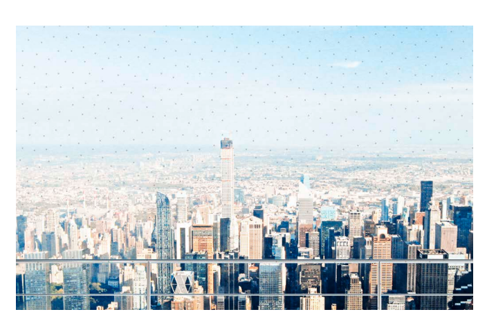
Thanks to the seamless design of ORNILUX® design dots, there is no additional waste.

Bird-friendly architecture involves an overall concept that takes into account not only the use of bird-friendly glass, but also the actual building designwith the surrounding environment and landscaping.