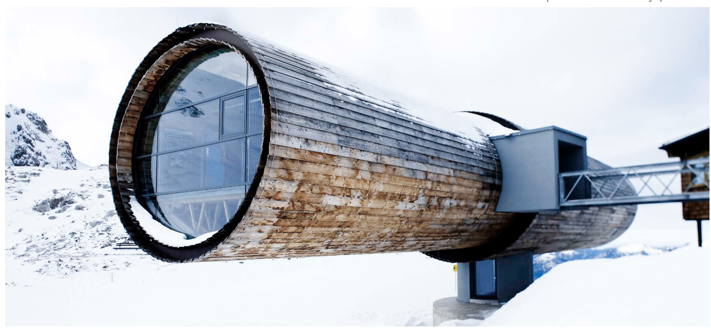
Mountain station Karwendel, Mittenwald Germany

Just as standard insulating glass units ORNILUX® can be installed in all window and facade systems. The coating makes the difference and can additionally be combined with other functions such as sound and heat insulation as well as solar control is possible without any problems.