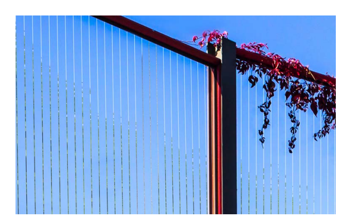
ORNILUX® design lines. The high effectiveness of ORNILUX® design markings has been confirmed by tests in the Hohenau-Ringelsdorf/Austria flight tunnel.

Even though tested bird-friendly glass products contribute significantly to the reduction of bird strikes, a complete prevention of bird collisions is not achievable.