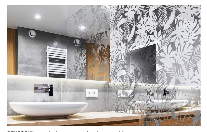
\mathsf{DEKOREX}^{\texttt{®}} decodesign as part of a shower cabin.

The decodesign versions are also available in combination with laminated safety glass to suit your ideas. The surface mirror is resistant to abrasion, acid, condensation water and salt spray in accordance with EN 1096-2 Class A and can therefore be used without any problems indoors and outdoors – from shower cabin to impressively designed glass facades.