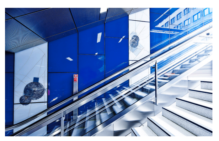
DEKOREX® screen print at the Wehrhahnlinie in Düsseldorf, Germany.

Let your creativity run wild with DEKOREX® digital print. In the digital printing process, the colour for individual images, photos or designs is applied directly from the PC to the glass. The colours are permanently burnt into the glass surface in a subsequent tempering process in the oven, making them extremely scratch-resistant. All common file formats such as PDF, JPG or EPS with a resolution of at least 300dpi are suitable for printing. Compared to the screen printing process, no screens have to be produced for printing. Digital printing is therefore suitable for small quantities or even individual pieces. As for the previous mentioned processes the application extends to indoor and outdoor areas.