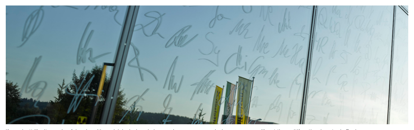
If you don't like it so colourful and exciting, plainly designed glasses also ensure an exclusive appearance, like at the multifunctional centre in Raaba.